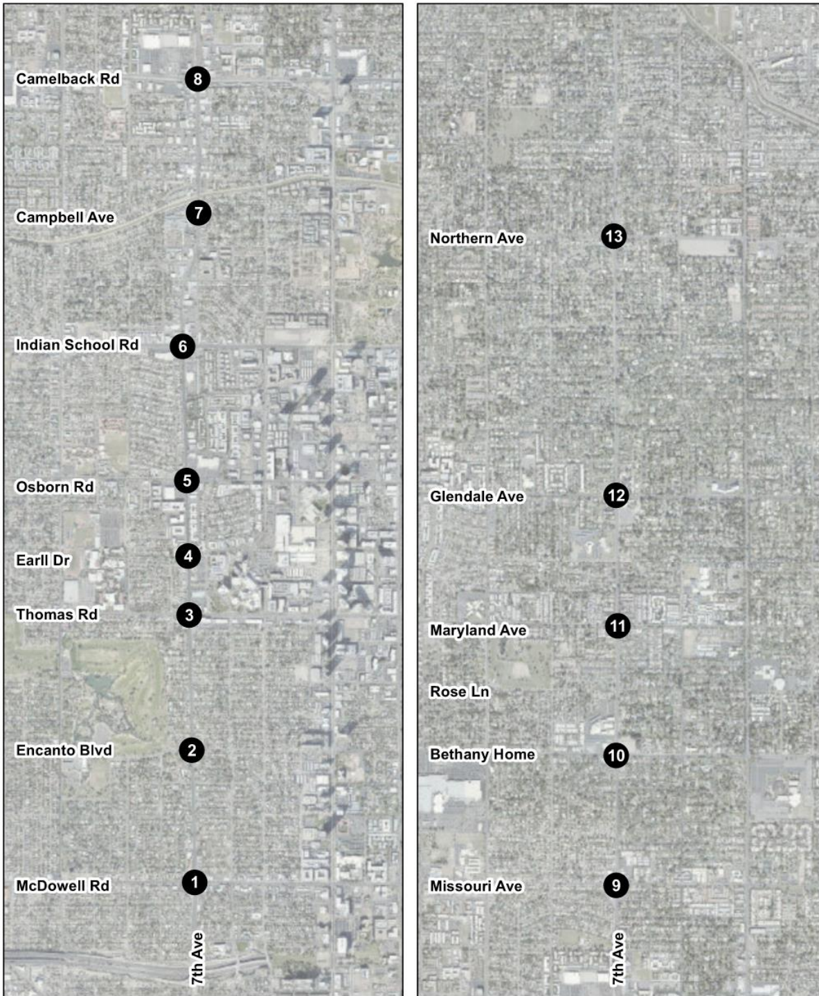
Figure 8 – 7th Avenue Turning Movement Count Locations